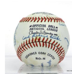
Title: Baseball Autographed by the 1983 East Marietta National Little League Team Date: 1983 Primary Maker: Rawlings Medium: Leather, Cork, Ink, Thread Collections: Sports