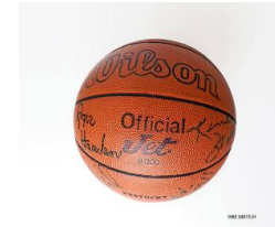
Title: Basketball Autographed by the Kentucky Wildcats Men's Basketball Team Date: 1983 Primary Maker: Wilson Sporting Goods Medium: Leather, Rubber Collections: Sports