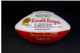
Title: Football Autographed by Joe Montana Date: 1982 Primary Maker: Wilson Sporting Goods Medium: Leather, Paint, Ink Collections: Sports