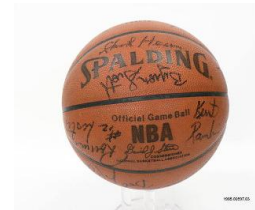
Title: Basketball Autographed by the Los Angeles Lakers Date: 1985 Primary Maker: Spalding Medium: Leather, Rubber, Ink Collections: Sports