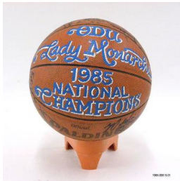
Title: Basketball Autographed by the Old Dominion Monarchs Women's Basketball Team Date: 1985 Primary Maker: Spalding Medium: Leather, Rubber, Paint, Ink Collections: Sports