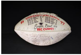
Title: Football Autographed by the University of Alabama Crimson Tide Date: 1978 Medium: Leather, Paint, Ink Collections: Sports