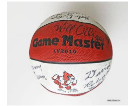
Title: Basketball Autographed by the Louisville Cardinals Men's Basketball Team Date: 1986 Primary Maker: Game Master Medium: Leather, Rubber, Ink Collections: Sports