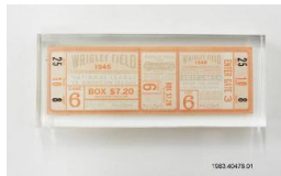
Title: 1945 World Series Game 6 Ticket Date: October 8, 1945 Medium: Paper, Ink, Plastic Collections: Sports