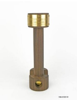
Title: Wooden Handweight Date: January 19, 1984 Medium: Wood, Metal (brass) Collections: Sports