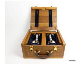
Title: 20 lb Dumbbell Set Date: 1982 Primary Maker: World Class Gym Equipment Medium: Metal, Wood (mahogany, teakwood), Fabric (velvet) Collections: Sports