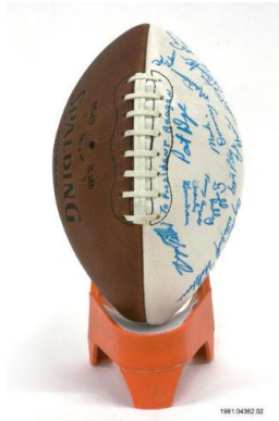
Title: Football Autographed by the Auburn Tigers Date: 1981 Primary Maker: Spalding Medium: Leather, Ink Collections: Sports