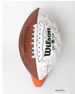
Title: Football Autographed by the New York Jets Date: 1985 Primary Maker: Wilson Sporting Goods Medium: Leather, Ink Collections: Sports