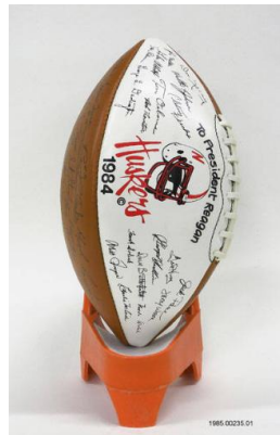
Title: Football Autographed by the Nebraska Cornhuskers Date: 1984 Primary Maker: Spalding Medium: Leather, Thread, Ink Collections: Sports