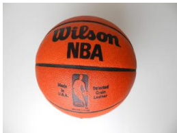
Title: Basketball Autographed by Larry O'Brien Date: 1983 Primary Maker: Wilson Sporting Goods Medium: Leather, Rubber Collections: Sports